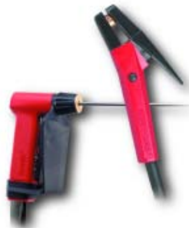
Cover Photo: Arcair K4000 Extreme Gouging Torch in action.