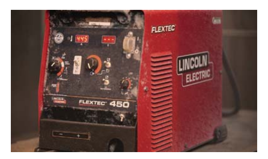
Among other tests, the Flextec™ 450 was subjected to extreme temperature environmental testing, including heat, cold, humidity, rain and dust.

IP23 Rated – While the fan is operating, the machine is subjected to a rain shower that directs water 60 degrees from vertical. While the machine is still wet, it must withstand a high voltage dielectric test and an insulation resistance test.