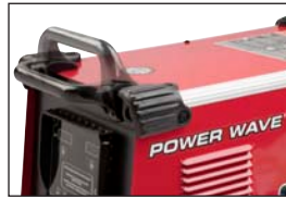
Reversible handles shown